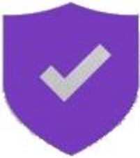
Protect Yourself Rules